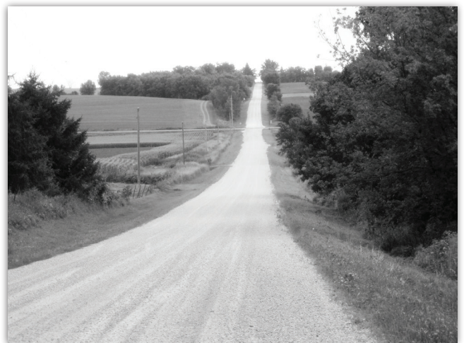
"How far would you go for me?"

All this aside, I must admit I do love "Poised Taupe." It looks great on our walls.