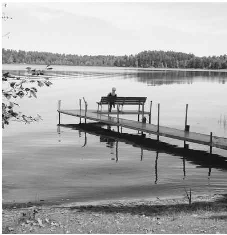
Calm. A place to write.

Our new website is up and running. It looks good and we've had encouraging feedback on the ease of navigating and updated look. Do check us out at www.ransomfellowship.org . We appreciate any and all feedback.