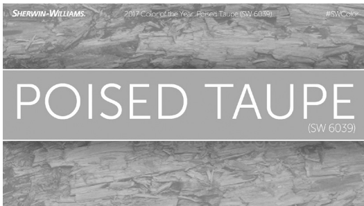
Sherwin Williams' color of the year.

The walls of the living room are mostly accessible to average home-owners who are fit and in the prime of life. There was just one troublesome spot that presented a tiny problem because it is practically in the stratosphere. Like maybe 25 feet into the stratosphere. Husband looked up at that spot on the wall and said I want you to promise me you won't get the ladder and climb up there. He doesn't like heights and besides his knees hurt pretty much all the time, so he couldn't do it, but he sure didn't want me to do it either. I solemnly replied, I promise. I won't.