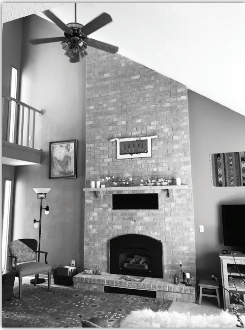
How high is that?

me. Apparently the height of the ceiling isn't the only place with a difficult reach for me, so are certain kinds of wisdom and I'm not there yet. Still, I have hope that some day I'll reach a better place than where I am now. (Though given my age, it better happen fast.) It was also wrong to break my word. I'm sorry for it. The best I can offer at the moment is that I better not make a promise unless I plan to keep it.