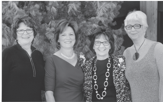
My mom next to me and my two sisters.

What in life sustains us for the long trip to the end of our days? Sometimes a stream of despair causes me to doubt I'll make it looking even slightly holy or reasonably sane. And if I can't be sane, could I, please God, still end up as a kind and thankful person?