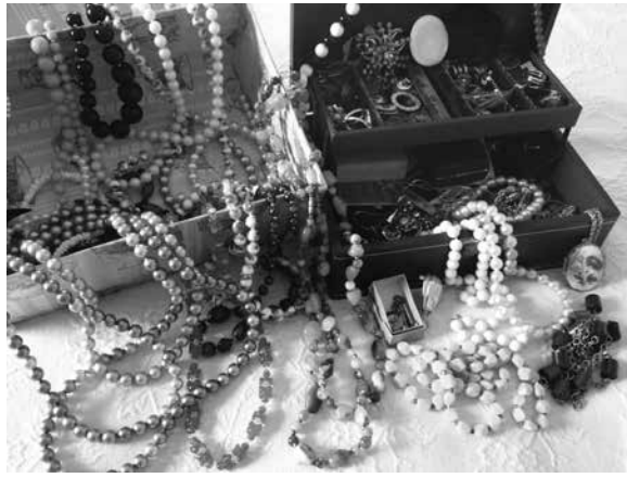
Aunt Ruth's jewelry collection

Still, I don't think 7,000 books compare to the refrigerator Denis frequently visits trying to sneak things into the trash without my knowing. Things I am saving. Like creamy horseradish sauce, pepperoncini, capers, fish sauce, angustora bitters (What are they for, ANYway?) ... all these necessary ingredients for that wonderful something I might make some day. When I catch him with his head in a shelf crying, WHAT'S this???. You never use it! It looks like rotten raccoon carcass! I'm throwing it out! NOOOOO. That's