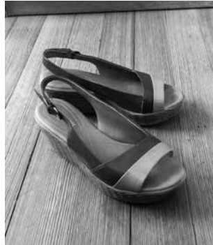
Pink, mango and honey.