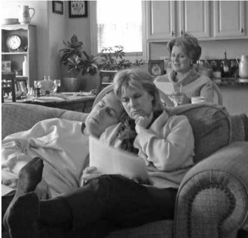
Asleep but still dangerous.