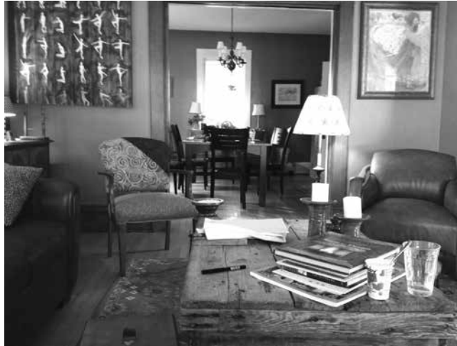
Toad Hall Living Room

"nowhere farm," because we have often advised people about where to move when they faced a big change. We say you must not move without considering where and who your community will be. What church or body of Christians will you become a part of? Who are